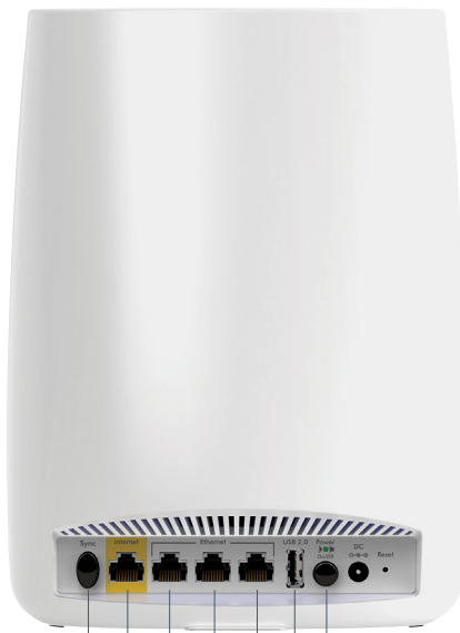
Sync button Plugs into existing modem Plugs into Ethernet-enabled devices USB 2.0 port Power button