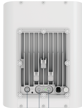
LED On/Off | Power On/Off WPS On/Off